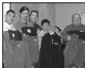
The Co-op staff was presented with NHHR jackets at the Annual Meeting this past December.